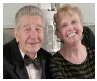
Chicago South Elks Lodge