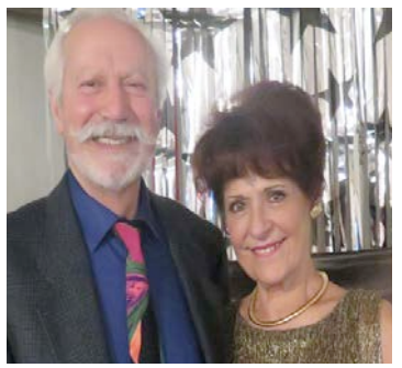
December 31, 2018