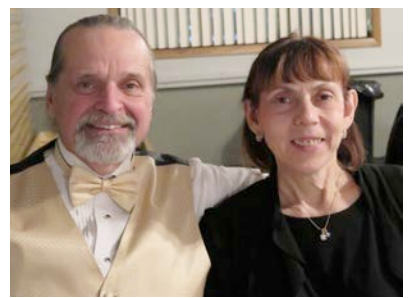
Thanks for the pictures everyone - Mary Lou